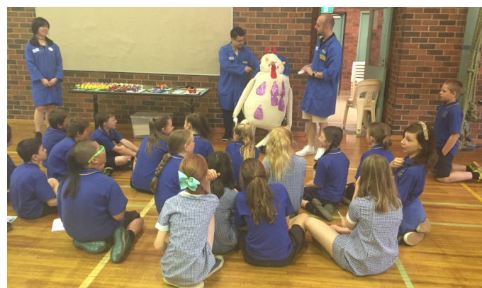
Gr 5P students participating in the GTAC (Science) session