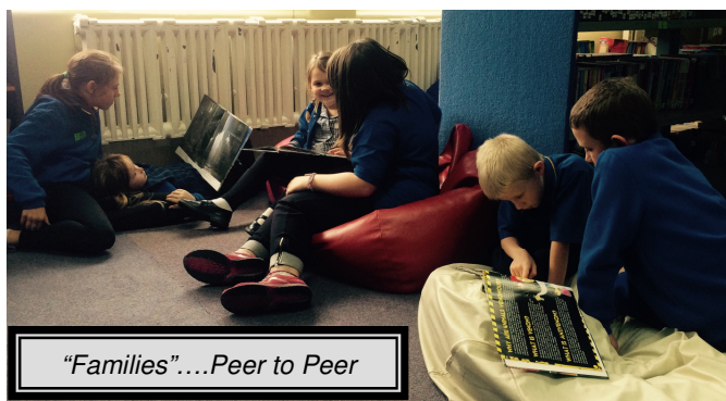
"Families"....Peer to Peer

Thank you to all who donated. The amount we received and passed on to the appeal ... a whopping $720.80! Which is equivalent to 14,416 5c coins.