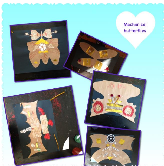
Mechanical Butterflies by Alana